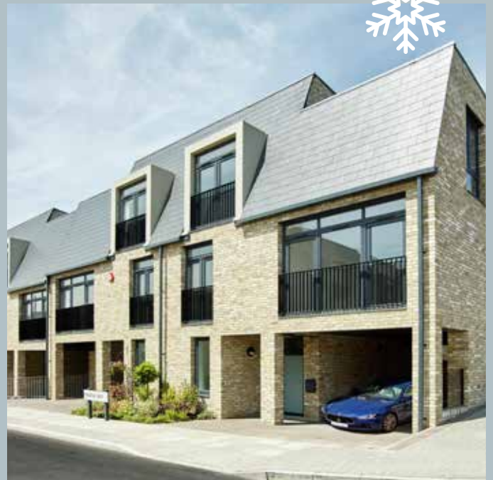
CGI of phase 2