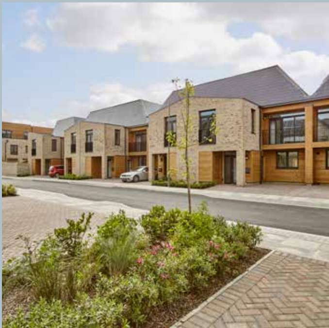
Completed homes on phase 1

The partners would all like to wish all residents a very Merry Christmas and a Happy 2016!